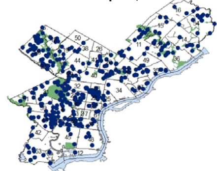
A. albopictus Locations a Philadelphia, 2017

Zika, dengue, and chikungunya viruses are spread by Aedes spp. mosquitoes, which are daytime biters and found around homes due to their short flight range. A. aegypti , a principle vector for transmission of these viruses is not found in Philadelphia. A. albopictus (Asian tiger mosquito), a less efficient vector are present and active during warmer months in Philadelphia. PDPH will continue to assess the presence of A. albopictus in Philadelphia and closely monitor human surveillance data to promptly identify local transmission should it occur.