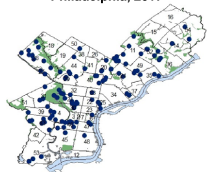
A. albopictus Locations a Philadelphia, 2017

a Adult A. albopictus identified 158 times at 113 locations.