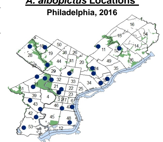
<sup>a</sup>A. albopictus identified 33 times at 23 locations.