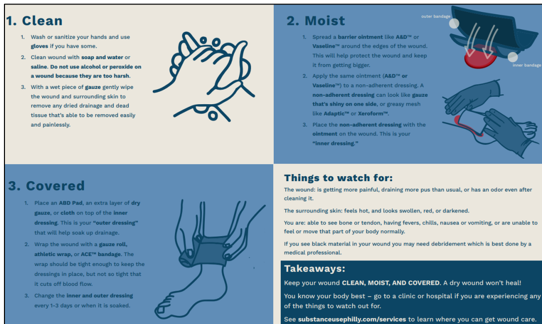
Figure 2: Basic wound care